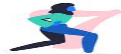
FORWARD LUNGES 10 REPS/SIDE