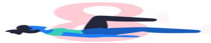
LEG BICYCLES 60 SECONDS