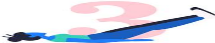
VERTICAL LEG RISES 20 REPS