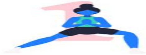
SIDE LEG LUNGES 10 REPS/SIDE