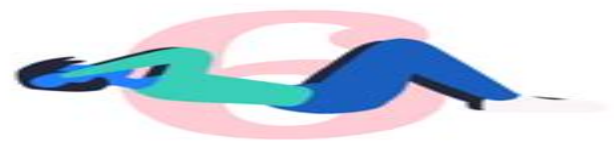
SIMPLE CRUNCHES 15 REPS