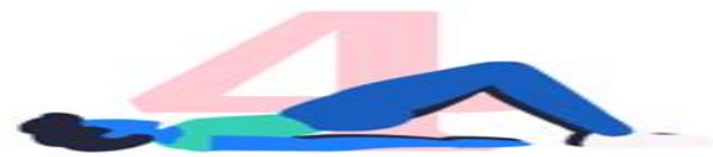
GLUTE BRIDGE 20 REPS