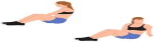
1) Russian Twist