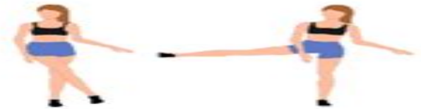
4) Side Leg Raises