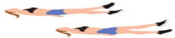
2) Flutter Kicks