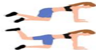
6) Donkey Kicks