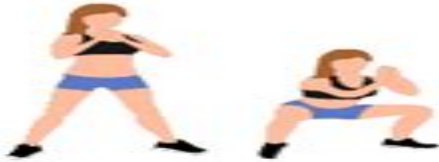
3) Sumo Squats