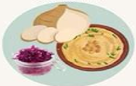
jicama with hummus + a forkful of sauerkraut