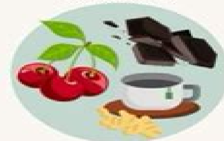
cherries & dark chocolate with ginger tea