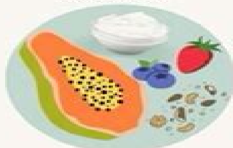
papaya boat filled with yogurt (non dairy / dairy), berries, & your fav crunch (ex: gluten-free granola)