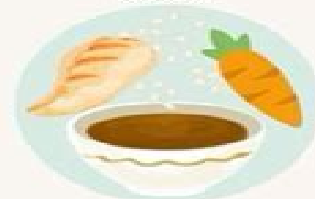
bone broth soup with shredded (roasted) chicken, steamed carrots, basmati white rice, & herbs