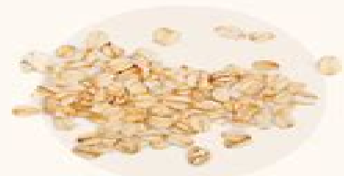
Oats and Barley